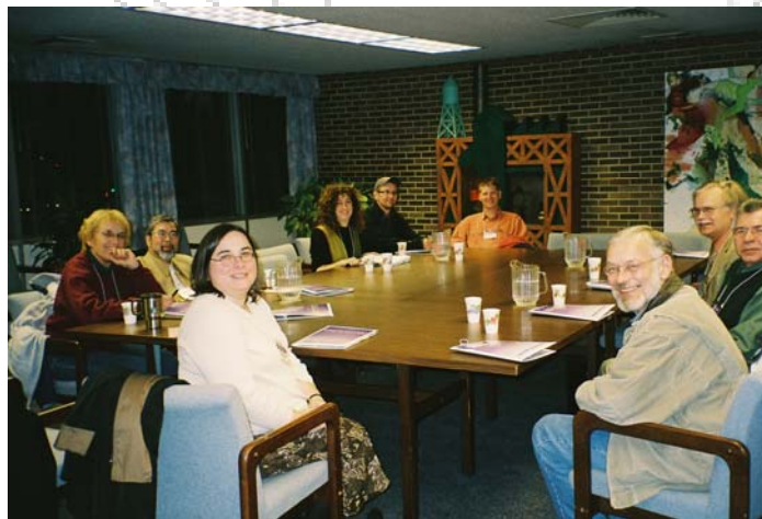
Attendees at the 2006 Business Meeting